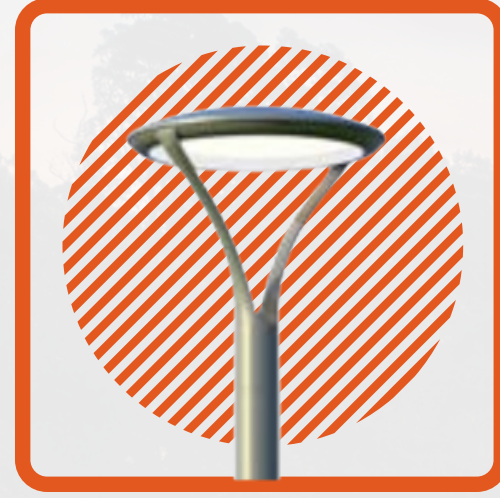
RADEAN POST TOP P1, P2, P3