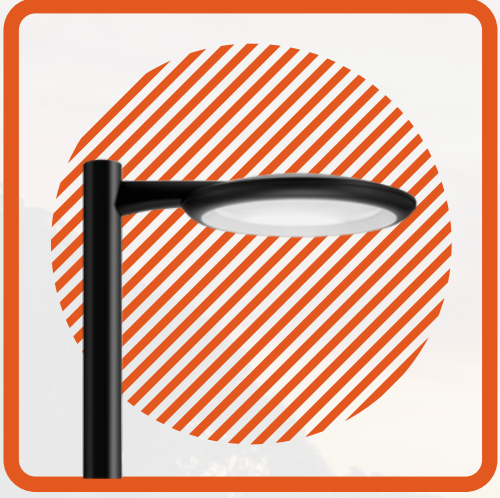
RADEAN ARM MOUNT P1, P2, P3