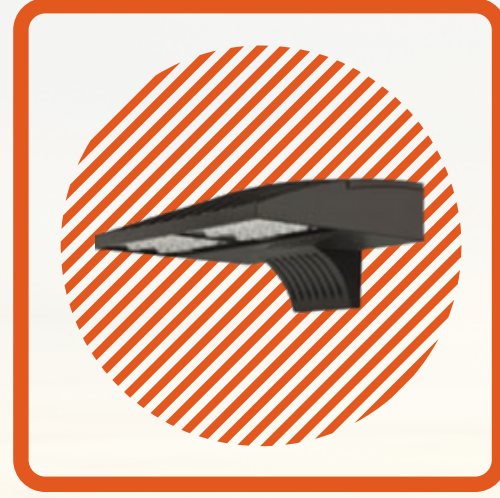
LITHONIA WALL PACKS