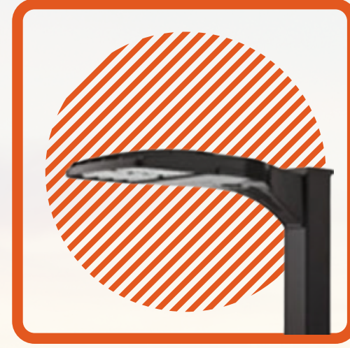
D SERIES DSX0 ARM MOUNT P1