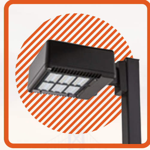
KAD LED ARM MOUNT 20C