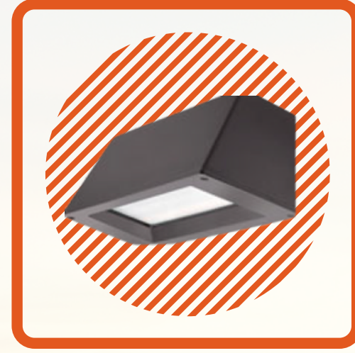
LITHONIA WALL PACKS