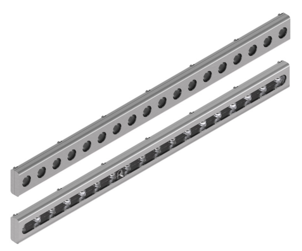
open bezel for -xn optics options