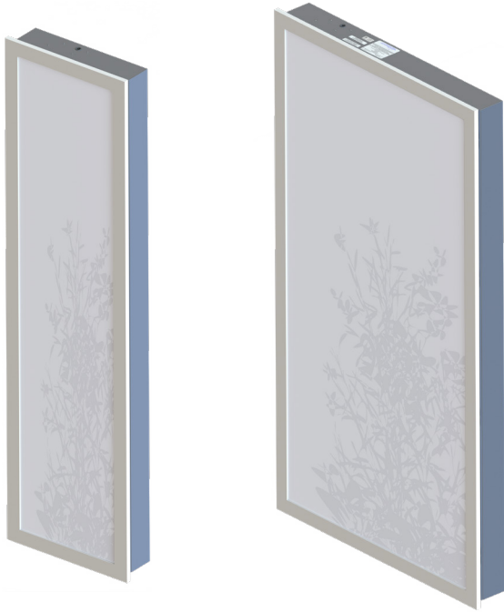
MRI LED Illuminated Image Wall Fixtures