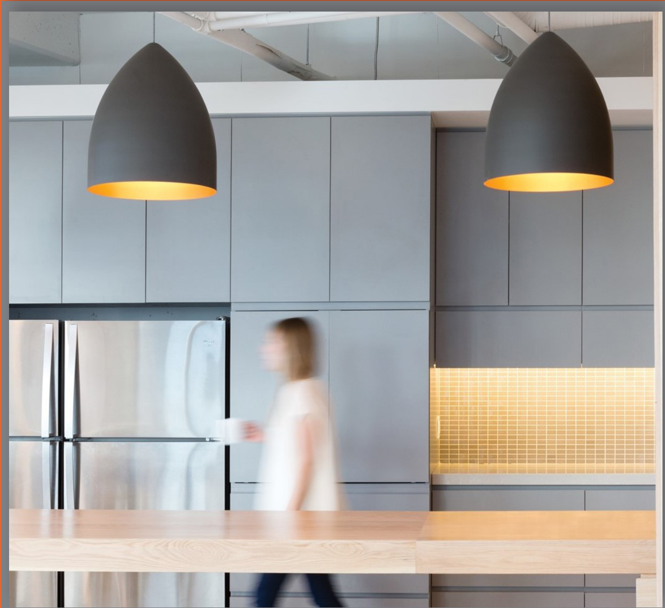
SIGNAL PENDANT BY TECH LIGHTING